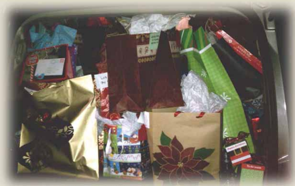
This SUV was completely full of gifts being delivered to the WTLC donated by our NAWIC chapter!!